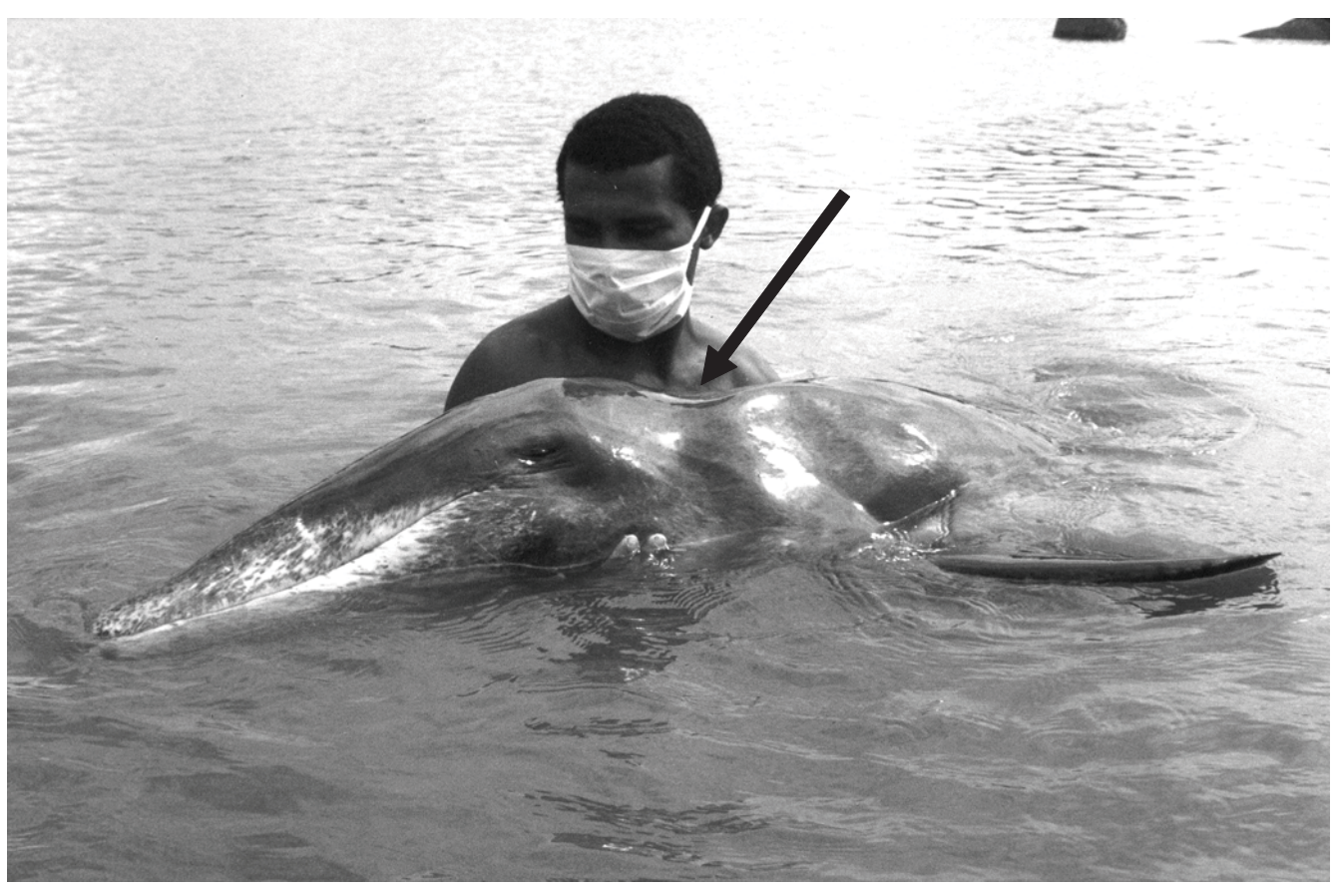
FIGURE 2: Emaciated rough-toothed dolphin supported in shallow waters of Poço da Draga beach. Note the pronounced "neck" (arrow) formed by the atrophy of the epaxial muscles.

Due to the animal's health condition and the impossibility of putting it back into the ocean, the AQUASIS rescue team decided to transfer the dolphin to the Centro de Reabilitação de Mamíferos Marinhos, but it died while being transported. During the necropsy, stomach analysis revealed the presence of two plastic bags (a combined weight of 14.12g) and four pieces of sea sponges (16.96g) occupying 2/3 of the forestomach chamber, and occluding the passage to the main stomach, where the majority of digestion occurs. The three stomach chambers were completely free of food remains, indicating that the dolphin had not been feeding for some days. The examination of the fore-stomach chamber mucosa showed the presence of several ulcers, probably caused by the presence of the debris and the excessive production of gastric acids.