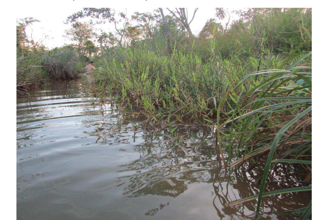
FIGURE 6: Do Almoço Creek close to bridge in the MG-323 highway. Land grass immerged in water attracts a large number of Australoheros mattosi specimens and other fish species.

Several recent collections conducted by the authors with gillnets and hand nets in various rivers and creeks without aquatic vegetation revealed scarce specimens, while in lagoons and creeks with dense aquatic vegetation (or marginal vegetation densely inserted in water) the number of Australoheros mattosi specimens is high and they were always collected along with vegetation (Figures 6 to 8). Australoheros mattosi specimens were not collected in sandy and/or pebbly/ rocky bottom areas.