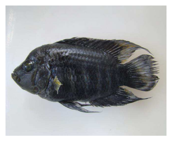
FIGURE 2: Lateral view of Australoheros mattosi , 107.8 mm SL, male, DZUFMG 130, Comprida Lagoon, PNSC.

Seventh body bar partially over head, above opercle region. In front of it, above the post-ocular region, a clear area is observed, in front of which the head is uniformly dark brown dorsally, clearing ventrally. Head light brown with one bar uniting the post-ocular region from one side to the other of head and another bar over snout.