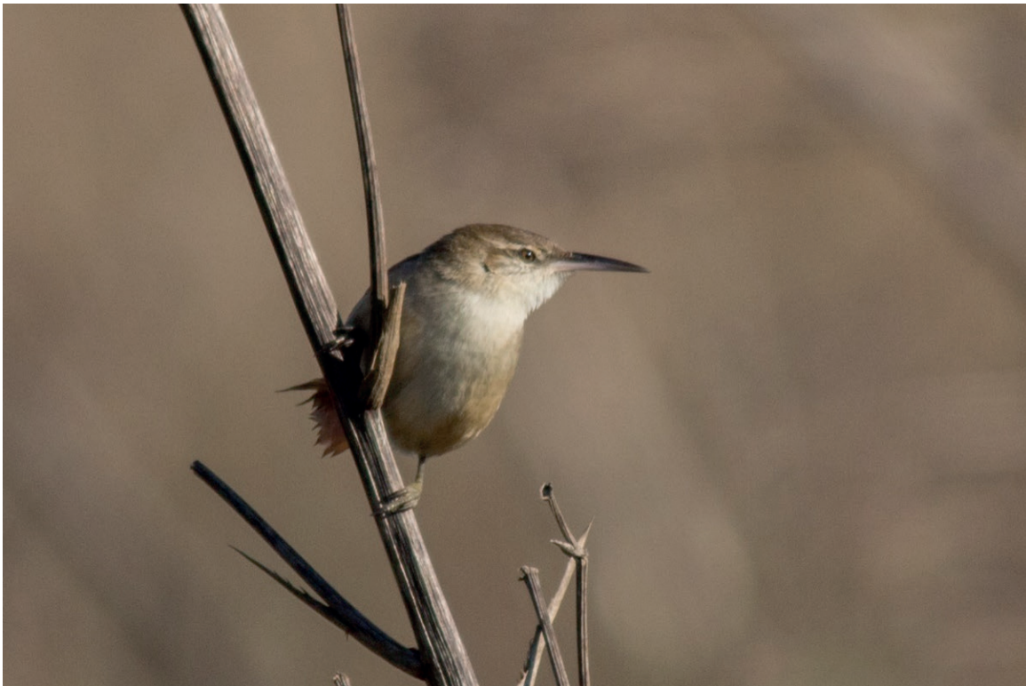
FIGURE 1: Individual of straight-billed reedhaunter ( Limnoctites rectirostris ) recorded in Palmas, Paraná. Author: Andriola, J.V.P. 2017.

On 12 July 2017 an individual of straight-billed reedhaunter was recorded (Figure 1) in the city of Palmas, Paraná State (26°34'31.96"S; 51°44'42.87"W). The bird was vocalizing on the leaf of a giant sea holly eryngo ( Eryngium pandanifolium Cham. & Schltldl) in a place characterized as a small marsh with a conspicuous amount of eryngos. Around the marsh there are many monoculture crops (oats and soybeans) and plantations of Pinus spp., which are threats to the natural habitat of the species (BRUMMELHAUS et al., 2012). The locality is less than 8.5 km from Refugio de Vida Silvestre dos Campos de Palmas, an important conservation unit of native fields in the region. A detailed observation was made, as well as photographs and a recording of the individual's vocalization, to correctly identify the species.