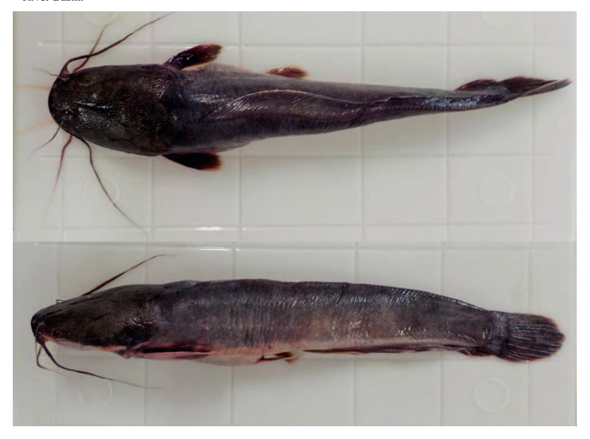
FIGURE 2: Dorsal and lateral views of a Clarias gariepinus specimen (UFRGS 22876 – total length: 50.5 cm) collected in the D'Una River Basin.

Although this species had already been documented in Brazilian inland waters in the last three decades (WEYL et al., 2016), this record of Clarias gariepinus documents a recent introduction in Brazil, and the