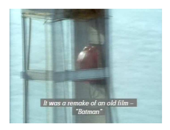
Figure 5: Screenshot from Talking Broken - The "talking broken" motif, 2 © 1990 Frances Calvert