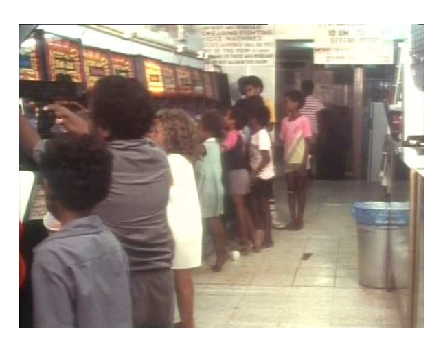
Figure 10: Screenshot from Talking Broken - Video arcade © 1990 Frances Calvert