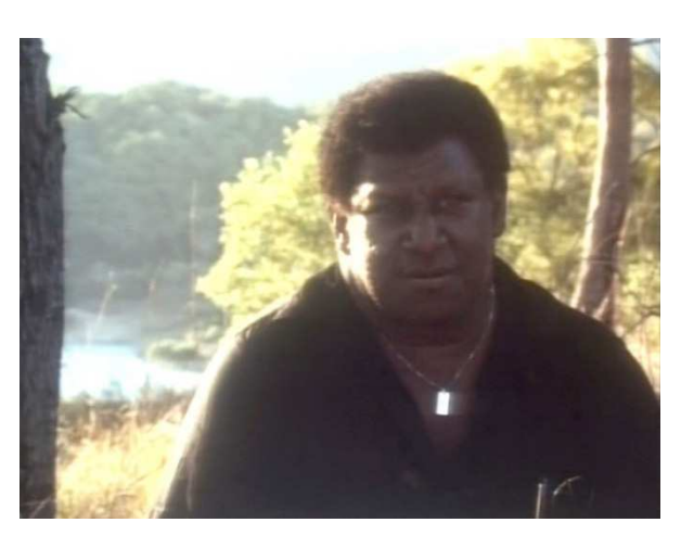
Figure 8: Screenshot from Talking Broken - Ephraim Bani