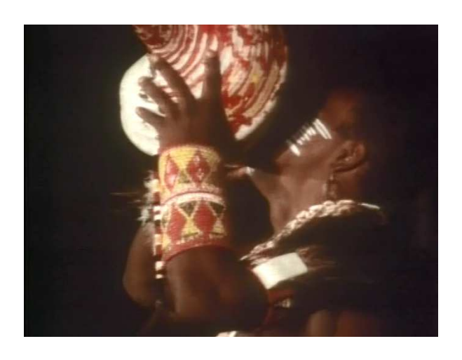
Figure 3: Screenshot from Talking Broken - Shell horn © 1990 Frances Calvert

but they centre on the idea of a mood, atmosphere or tuning, with the root implication of a voice (in this case, a series of non-linguistic voices, often using overtones, that are "tuned" like an instrument, or indeed a radio).