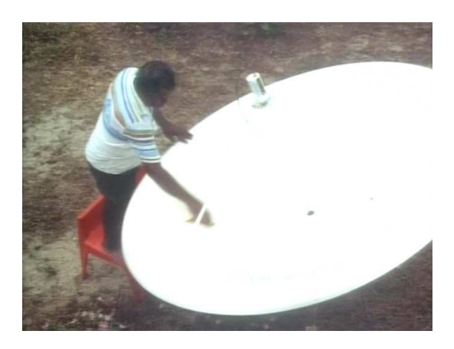
Figure 11: Screenshot from Talking Broken - Satellite dish © 1990 Frances Calvert

Such juxtaposed sequences are undoubtedly intended to be ironic and jarring, and they do make significant inroads into re-signifying the images, particularly the archival photographs, but the point here is not, I think, to make a simplistic claim to "pristine" Indigenous local identities being destroyed by globalized media, but rather to focus on the complexity of contemporary local/global hybridization and the extent to which such hybridity has a long past that precedes colonization, has outlived it and will continue in and through contemporary media rather than outside of them. Indeed, as the main protagonist in the debate, Bani goes on to discuss the importance of not dismissing such media forms per se, but of controlling them, and this is a crucial tenet of contemporary Indigenous media theory (e.g. Hokowhitu and Devadas): not only is control over representations important-but control over the means and institutions of representations (e.g. TV channels, media outlets, etc.).