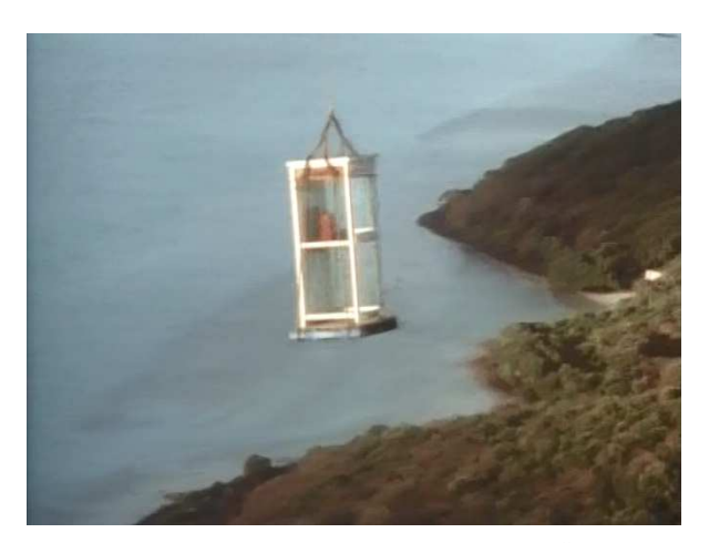
Figure 1: Screenshot from Talking Broken - The "talking broken" motif, 1 © 1990 Frances Calvert

I want to look at this film for two inter-related reasons. The first is that it explicitly thematizes the relationship between space, place and media in a postcolonial context, particularly in relation to film, television, radio and telephony, and the second is that it is set in a wider media context that includes national distribution (in educational institutions and museums, etc.) and international distribution (for TV, film festivals and DVD sales, etc.). I will attempt to address some of these themes by focusing in particular on the film's characteristically idiosyncratic leitmotif: an aerial shot of a helicopter bearing a telephone-booth on a wire (figure 1).