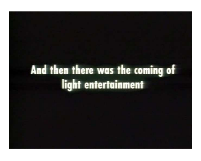
Figure 6: Screenshot from Talking Broken - "[T]he coming of light entertainment"