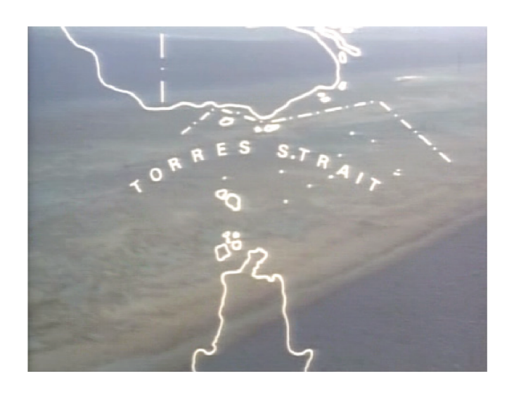
Figure 2: Screenshot from Talking Broken – Torres Strait Map © 1990 Frances Calvert

In the case of the Australian-controlled territory of Papua and the Torres Strait, such a convention began with Frank Hurley's documentary and feature films of the 1920s, some of the first of their kind to use aerial footage in this context (Australian Screen), but this convention has arguably become the visual cliché of the opening or establishing shots in Torres Strait film, positioning the islands spatially in relation to themselves and/or to the locality, the net rhetorical or semiotic effect of which is often to suggest disconnection and geographical or cultural distance conquered by technocratic power.<sup>5</sup> This is the ethnographic or documentary film equivalent of the power-laden and scene-setting "arrival" in classic ethnographic texts (Pratt).