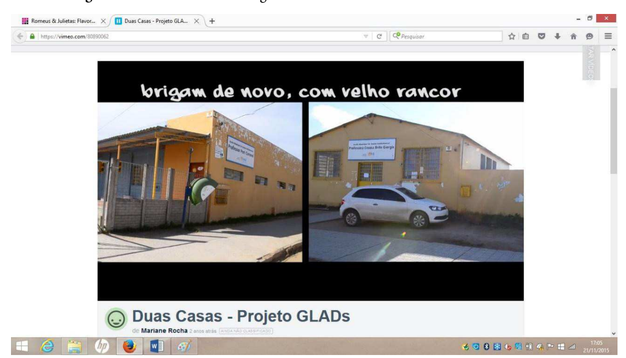
Figure 5: Schools from both neighbourhoods

The cutaway scene is quick and returns to the interview scenes in which the interviewees discuss separately the possible rivalry between the neighborhoods. Again, there is an interruption and the insertion of a cutaway scene in which we see a parted screen showing the schools from both neighborhoods, Malafaia's EMEF Peri Coronel (on the left) and Ivo Ferronato's EMEF Creusa Brito Giorgis (on the right) (figure 5).