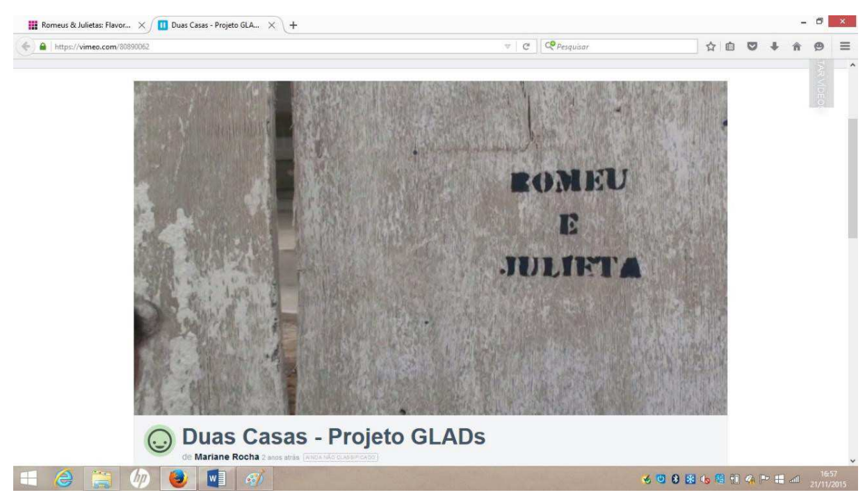
Figure 2: Stencils