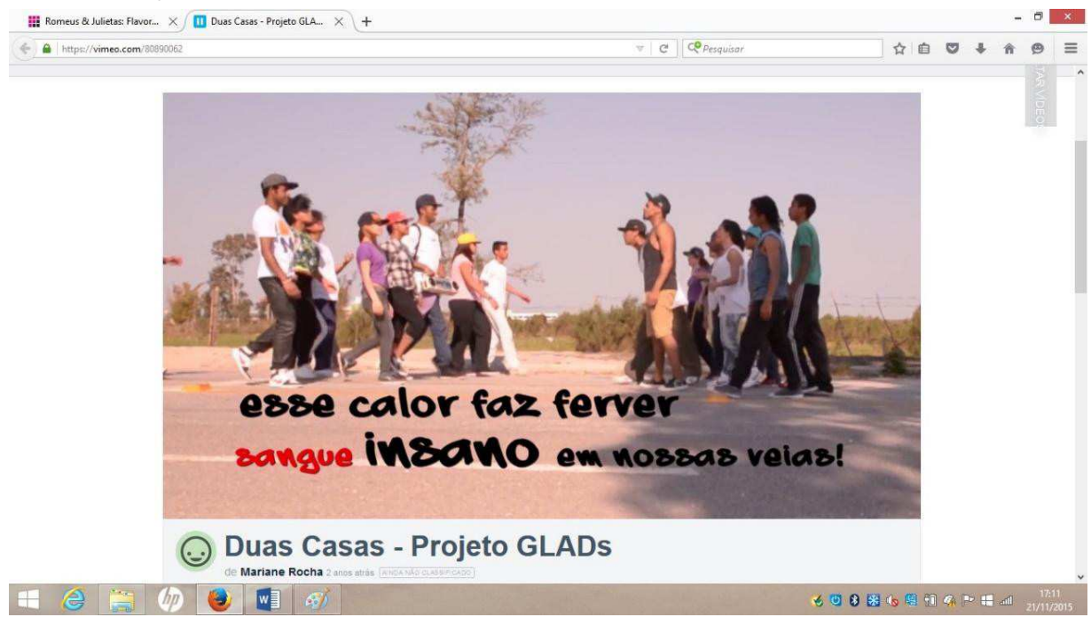
Figure 8: Battle scene

the neighborhoods and leads to the university that we can see far away in the background (figure 8).