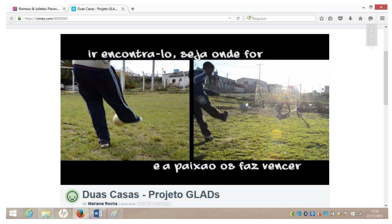
Figure 10: Soccer fields

The cutaway scene quickly returns to the interviews in which the dwellers are describing the relationship between the people from Malafaia and Ivo Ferronato. In different and separate statements, they all conclude by saying that their relationship is mostly peaceful and that the region nowadays is a single community. We have another insertion of a cutaway scene; this time we see the parted screen showing both soccer fields in a full shot; a boy hits the ball trying to score a goal. Also, we can read another passage from the prologue in Act 2: "ir encontrá-lo, seja onde for, e a paixão os faz vencer" while we hear a score that remixes hip-hop and samba (figure 10).