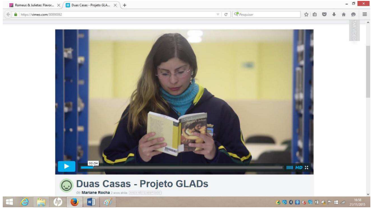
Figure 3: Girl reading the play Romeo and Juliet

The use of these cutaway shots, i.e., shots peripherally related to the main shot (we can call it main shot because the voice of the coordinator persists throughout the scene), might function as a commentary to illustrate the questions that motivated the creation of the project. The following scene shows a young girl wearing a school uniform in a library reading the play Romeo and Juliet (figure 3).