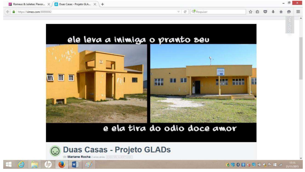
Figura 9: Health centers

After the battle scene, we have another cutaway scene, this time, a parted screen showing both health centers, again very much alike, and we read a passage from the prologue in Act 2: "ele leva à inimiga o pranto seu e ela tira do ódio doce amor", which might suggest the healing power of love (figura 9).