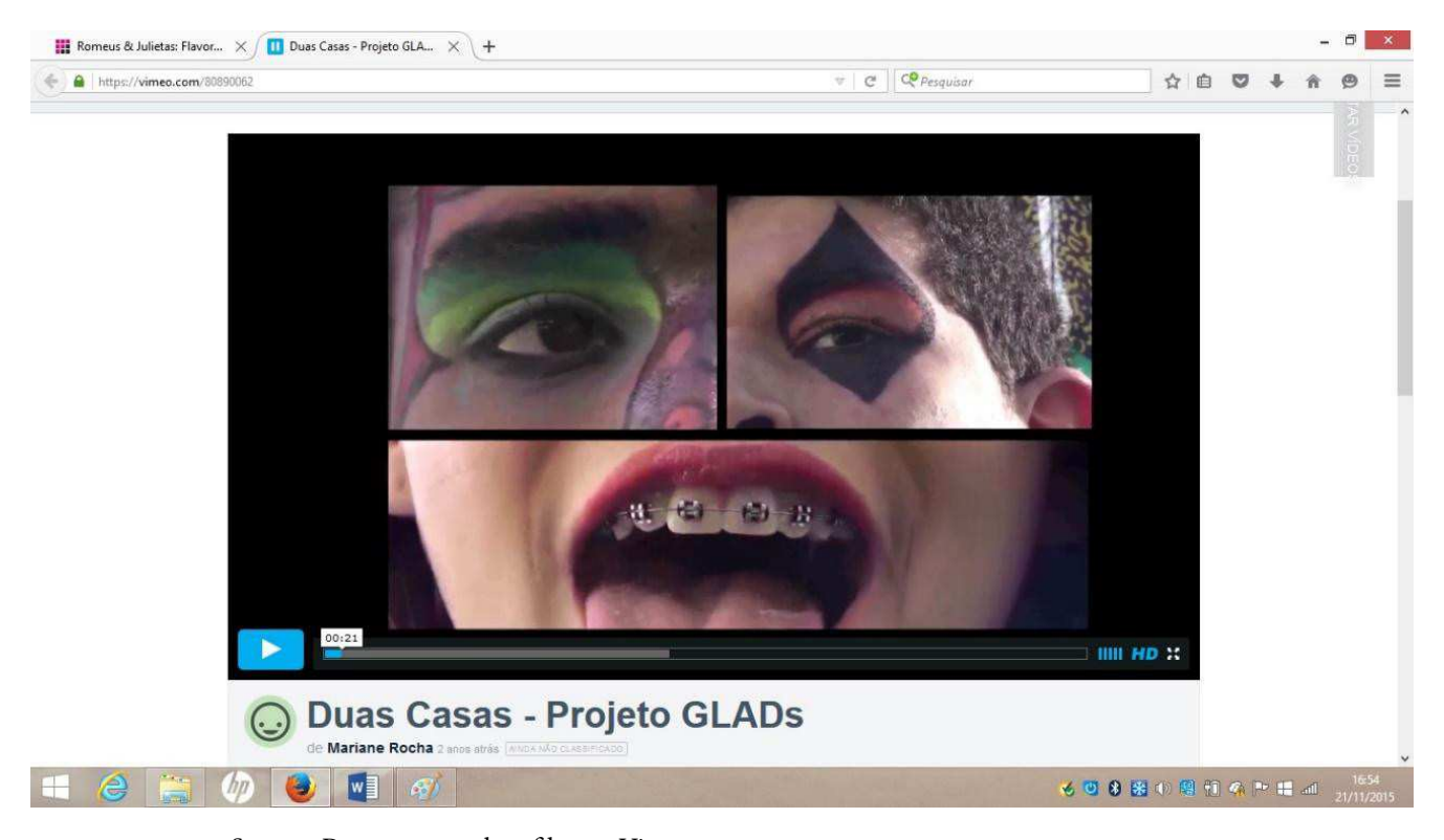
Figure 1: Duas casas – opening scene

The fourteen-minute film Duas casas starts with a sequence of fragmented images that form a disproportionate face, each time with a different mouth or a non-matching eye, representing the faces of several Romeos and Juliets. The projection of fragments of eyes and mouths gradually accelerates until turning into a frenetic rhythm along with the score, suggesting a confluence of several faces into a single one (figure 1).