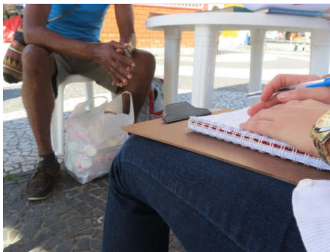
Figure 3: Conversation of the health professional with a homeless person.