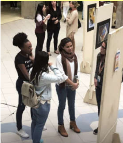
Figure 4: Exhibition of photographs of the activities carried out with the street clinic team in the Health Science Center hall.

From Mid-March of 2020, on site extension activities were interrupted due to the current pandemic scenario by Covid-19. The SCt's activities of Florianópolis were suspended and therefore it was necessary to rethink the format of the project because of social distancing and house isolation. University activities were also impacted, but the project coordinator remained virtually in contact with the fellow to set the expectations. After much dialogue, it was decided that the project would remain in a digital format through interaction via the research group's media. So, a weekly schedule of posts about the HPP subject and policies from the Ministry of Health were made, as well as videos were made to reinforce the idea. This remote activity was intended to produce informative materials, encourage scientific production, and share content about the project.