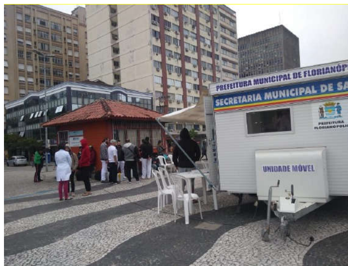
Figure 2: Hair cutting workshop with the street clinic team in Downtown Florianópolis.

Over time, the student and the project coordinator became more strongly connected to the professionals, meeting social demands and public health concerns that could be transformed. Thus, the scholarship holder, with the support of group volunteers and the health team, held hair cutting workshops, monitored nursing and medical consultations, sensitive listening about health problems, as well as guidelines for promoting well-being. In addition to creating a link with the team that provided invitations to biweekly multiprofessional meetings for care of the HPP.