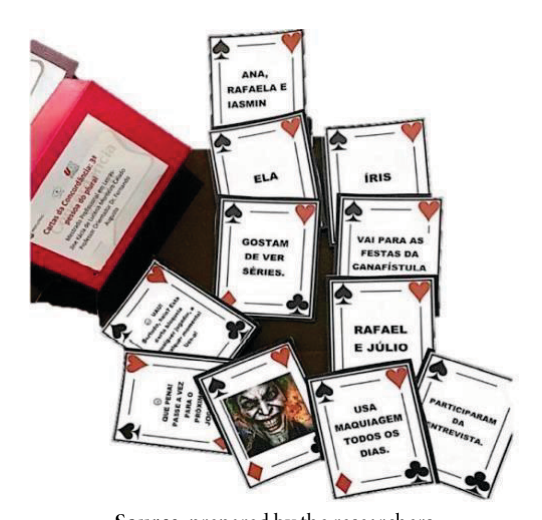
Game 03: Subject-Verb Agreement Cards: 3rd person plural

The next game is called "Subject-Verb Agreement Cards: 3rd person plural" and aims to reflect on the SVA3PP to stimulate linguistic reasoning about SVA in the 3rd person plural by analyzing the formed sentences. As they observe the cards placed on the table, students analyze whether or not there is an agreement between each subject and sentence.