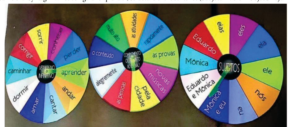
Game 01: "Syntagm Wheel: singular or plural?"; Structure of the sentence (Subject + Verb + Object/Adjunct)

One should also point out that after the end of each game, it is an essential step that the teacher systematizes what was learned until then, because at this point students should be encouraged to talk about their perceptions during the game, which will lead them to frame and share their knowledge.