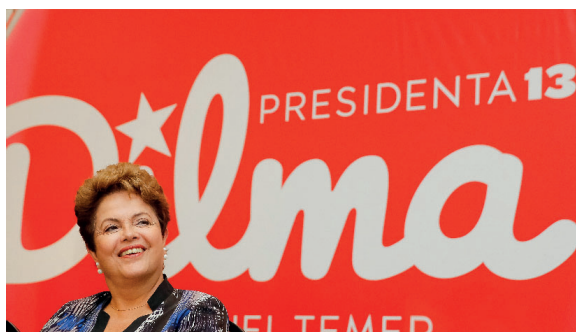
Figure 1: Presidenta Dilma Roussef

The patriarchal heritage and machismo in the language brought about a heated discussion when the first woman was elected to assume the Presidency of the Republic, in 2010, in Brazil, and there was much questioning about the use of the feminine inflection when referring to her by her position. Was it correct to use presidenta (female form) Dilma Roussef or does the noun presidente (president) not accept any variation, since it is common to both genders? Despite Dilma’s stance on wanting to be called presidenta (as shown in Figure 1), there was disagreement among specialists regarding the permission to use the word in the feminine, and many texts were written to discuss whether the Portuguese language is sexist and what the political dimension of a language is.